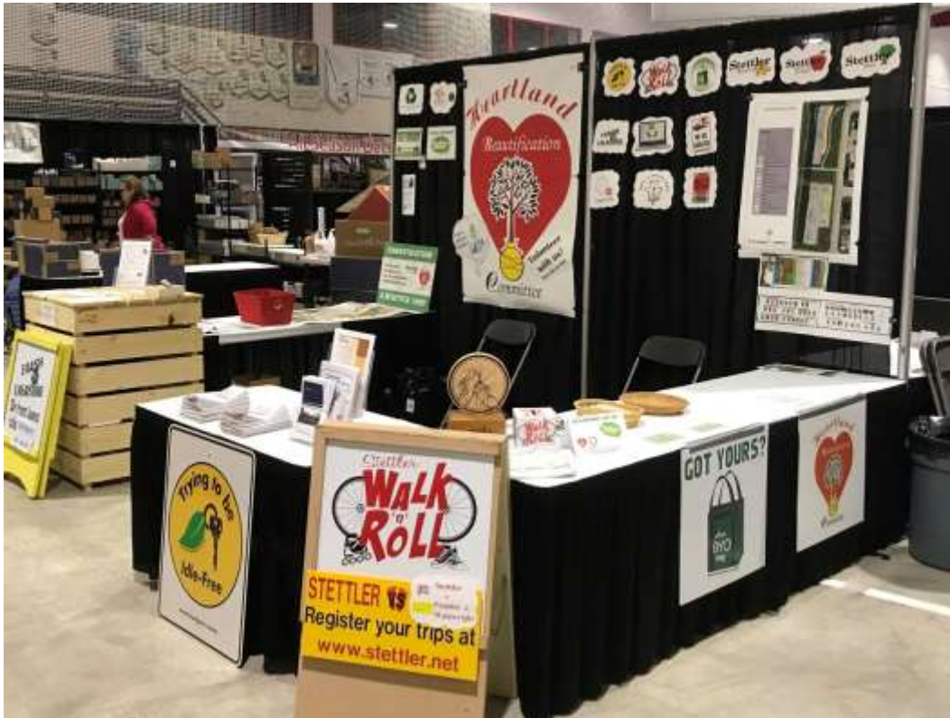
Booth in 2019