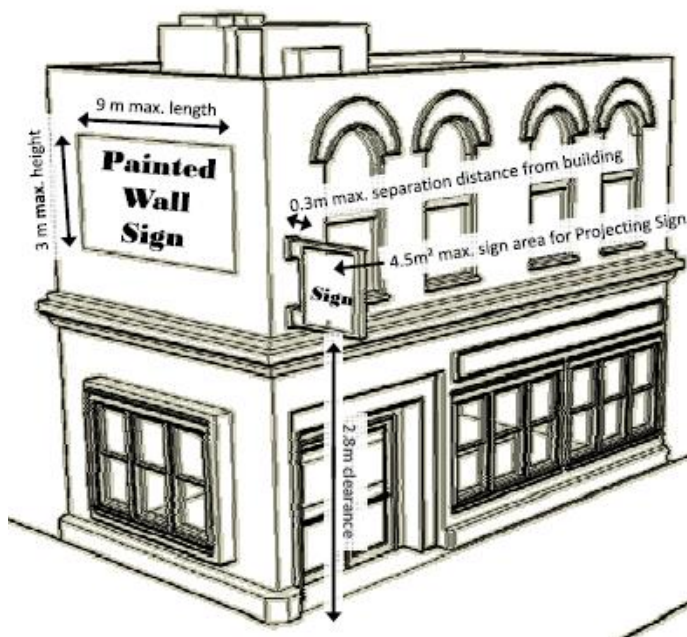
Figure 69-1: Painted Wall Signs and Projecting Signs