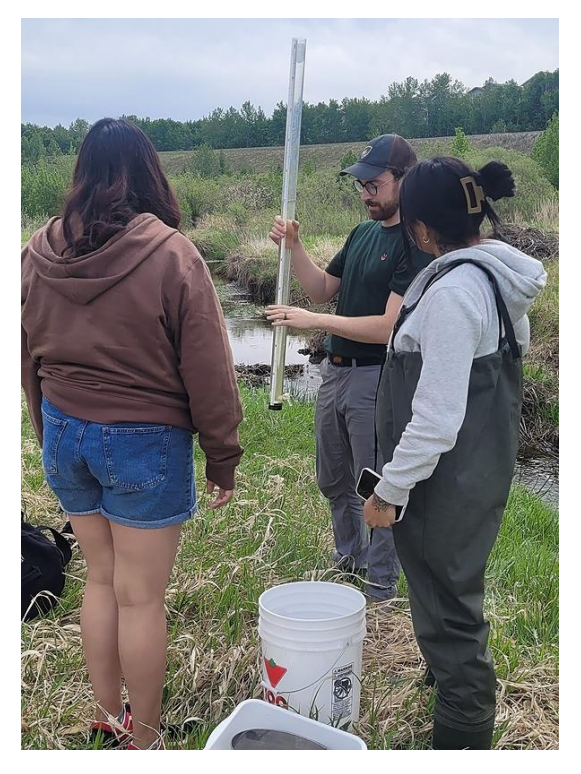
X-Stream Science Leader Training