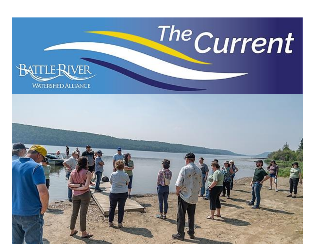
Thanks to everyone who came to the BRWA AGM & Bus Tour!

It was a great day of learning from local partners in watershed stewardship, celebrating the work of the BRWA over the past year and looking towards future projects, hiking through the Battle Lake fern glades, and enjoying the beautiful headwaters of the Battle River watershed.