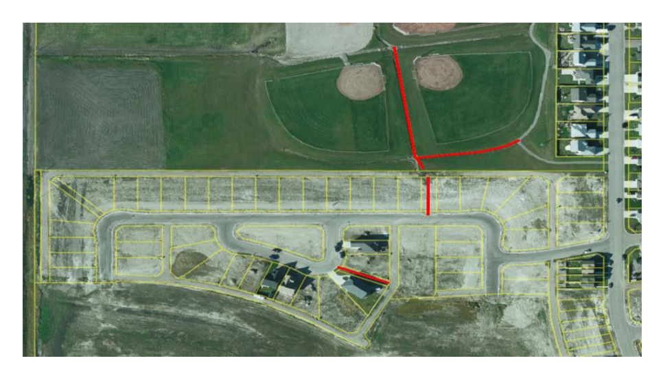
CAO G. Switenky advised that the connection of the Meadowlands pathways would be beneficial with the new home construction development that is happening within the subdivision.

3. Connection from 57<sup>th</sup> Street to 50<sup>th</sup> Avenue – West side of High school football field / running track – estimated cost - $45,000