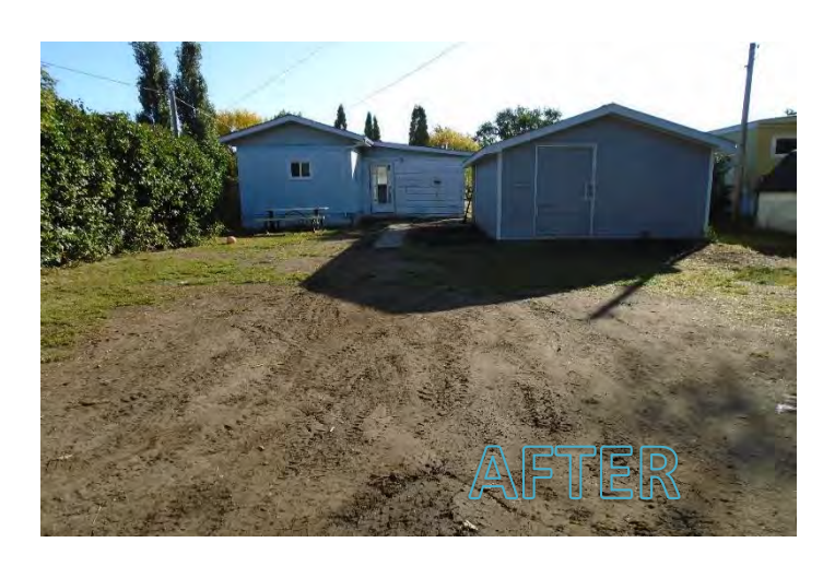
Bylaw Enforcement- Nuisance Property

Bylaw Enforcement for the year of 2019 has experienced an increase in the reports and investigations of nuisance and unsightly property. The total number of Compliance Orders and Stop Orders issued has resulted in many properties requiring follow up visits to ensure cleanup work has been completed. Derelict or abandoned homes and buildings are on