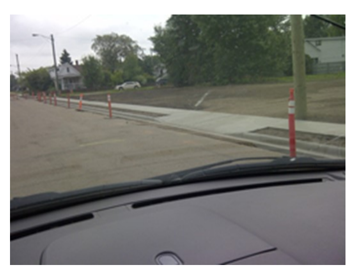
Street replacement– narrowed street with widened green footprint

Limiting soil quality issues have been overcome with some success through the use of raised berms for planting. Trees are planted at the top of constructed berms to allow trees some buffer between poorer quality layers of soils. Tree beds rather than rows are being developed throughout town.