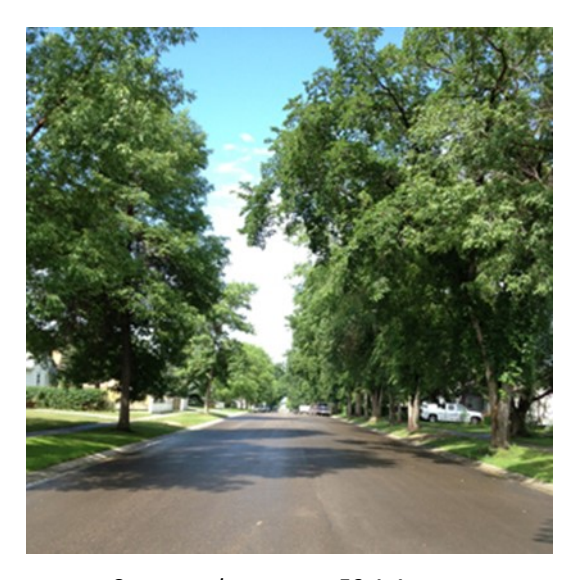
Street replacement – 50 A Avenue Narrowed street with widened green footprint