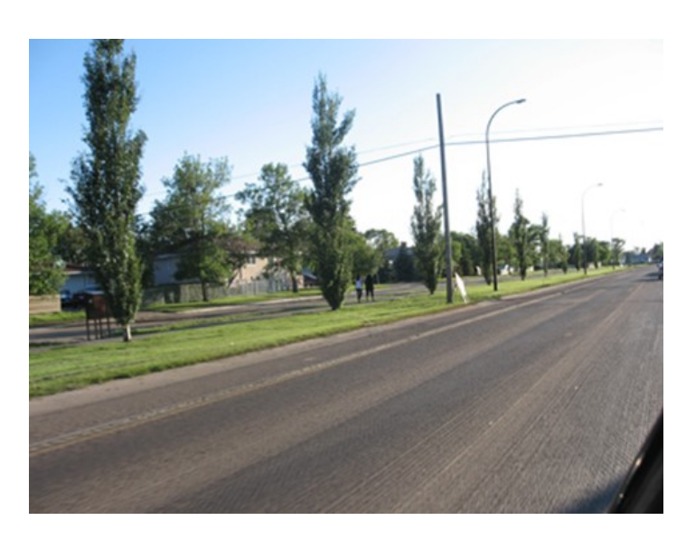
Trees planted along highway and walking paths

Street replacement / improvement projects include narrowing streets to widen the green belt/footprint under existing trees, rather than removing large, beautiful specimen trees.