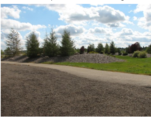
Berm planting system

Limiting soil quality issues have been overcome with some success through the use of raised berms for planting. Trees are planted at the top of constructed berms to allow trees some buffer between poorer quality layers of soils. Tree beds rather than rows are being developed throughout town.