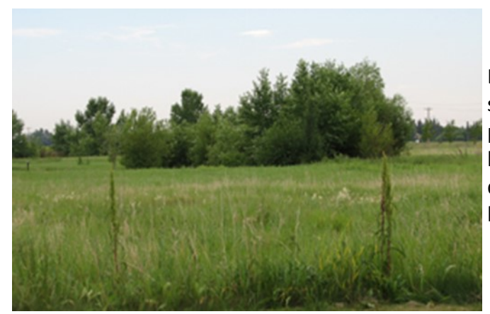
Combination planted and "naturalized" grove

In some areas (e.g., West Stettler Park), planted trees are typically not successful, therefore, naturalized seedling growth (natural groves) is encouraged. Only hardy trees and woody plant material are planted. As the groves develop, the undergrowth is cleaned up to create a tidy area. Currently, there is a high priority plan to add more trees to West Stettler Park, using proven techniques.