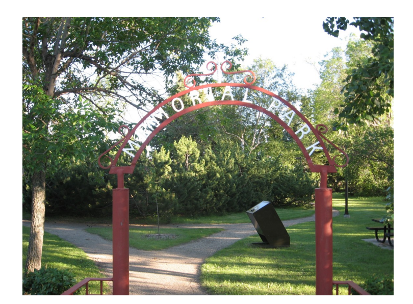
Pathway at Memorial Park

Pioneer Park – the majority of trees were donated from a local farmstead years ago, with the site being developed over time, to include a perennial-filled monument bed. Shale pathways crisscross the park. A large old-fashioned threshing machine sits on the north east corner of the park. (also see Heritage Conservation)