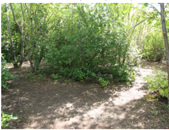
Pathways in Millennium Tree Park

A community orchard component was included in a third Community Garden site funding application to the TD FEF grant. A portion was approved (the tree/shrub part), and the money was used to plant over 200 fruiting shrubs at each of 2 community gardens (that did not have fruit), resulting in over 4000 sq ft of mulched orchard space added. They are growing nicely and are producing fruit for the public.