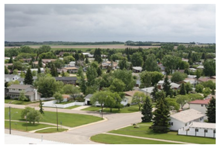
Treed neighborhood of Stettler