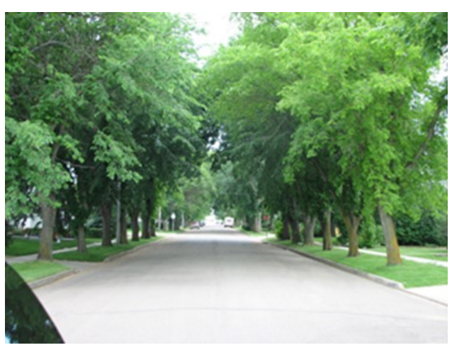
Tree-lined streets of Stettler Elm & Green Ash

Tree inventories have been considered but are currently not in place, other than an inventory of the elm street trees, as a part of the DED management plan. Future efforts to create a comprehensive tree inventory will be evaluated when resources permit.