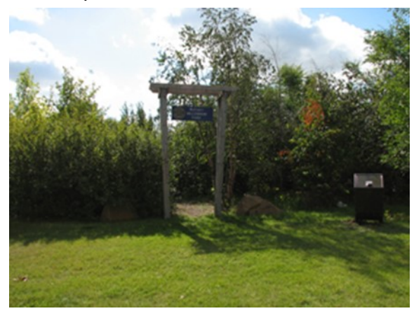
Rotary Millennium Tree Park

Rotary Millennium Tree Park – Rotary Millennium Park was planted in 2000 by students of the Stettler Elementary School as well as members of the community. The park was established using donated funds, with thousands of small seedling trees and shrubs planted in a large mulched block. Large boulders were placed to add a vertical presence. The trees and shrubs have grown quickly, forming a forested park. Pathways were cut out to wind through the park. Minimal maintenance is required. Visitors can walk in the shade, sample fruit from some of the trees and enjoy the diversity of species. Mulch pathways are replenished regularly. Gradually, Parks staff members have been cleaning up dead trees, which opens up the space.