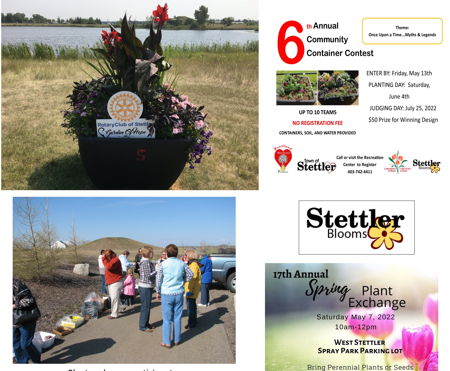
Plant exchange participants

Stettler Blooms sub-committee fell in love with the idea of developing an annual Container Competition, based upon one held in Kamloops, BC. The plan was developed over the winter of 2016/2017, with ten 36 inch Skyline self-watering planters purchased. The 1<sup>st</sup> Annual Community Container Contest was launched on June 3, 2017. Businesses, community groups, individuals, etc. are invited to register a team. Each team designs, purchases materials and plants their own planter based on a theme, such as "Canada 150" and "Colour your world". The 2022 theme is "Once Upon a Time, Myths and Legends". The containers have become very interactive with residents of Points West assisted living facility and add variety and colour to pathways