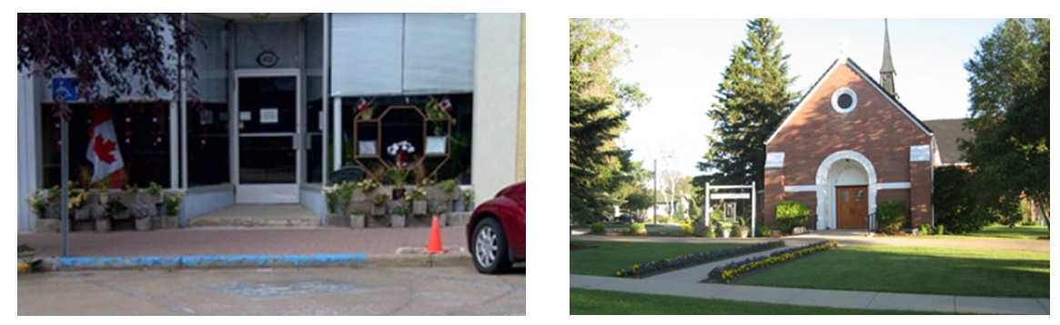
Beautified commercial property

Many local businesses decorate their properties with planters, hanging baskets or develop landscape beds. Some businesses take great pride in their displays and vary them regularly. We've noticed that many more businesses are beautifying their storefronts in creative ways.