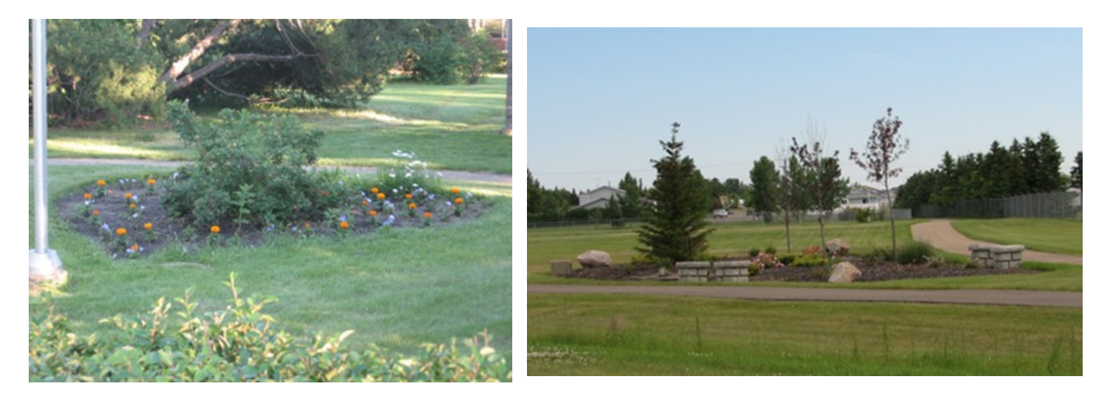
Heart shaped flower bed in Memorial Park

Most of Stettler's public plantings (in-ground beds) are composed of a combination of woody (tree and shrub) plant material, with some perennial floral plants included, in order to reduce installation / maintenance costs. The heart-shaped flower bed in the Memorial Park (Cenotaph) is planted and maintained by town staff (with assistance from Grade 5 students at the Stettler Elementary School).