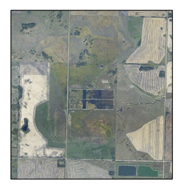
Arial view of waste water treatment