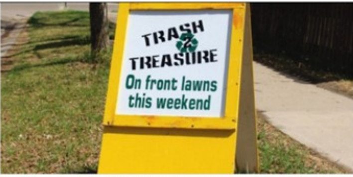
Frash 2 Treasure Days will be held in Stettler over the Mother's Day weekend of May 12 and 13.