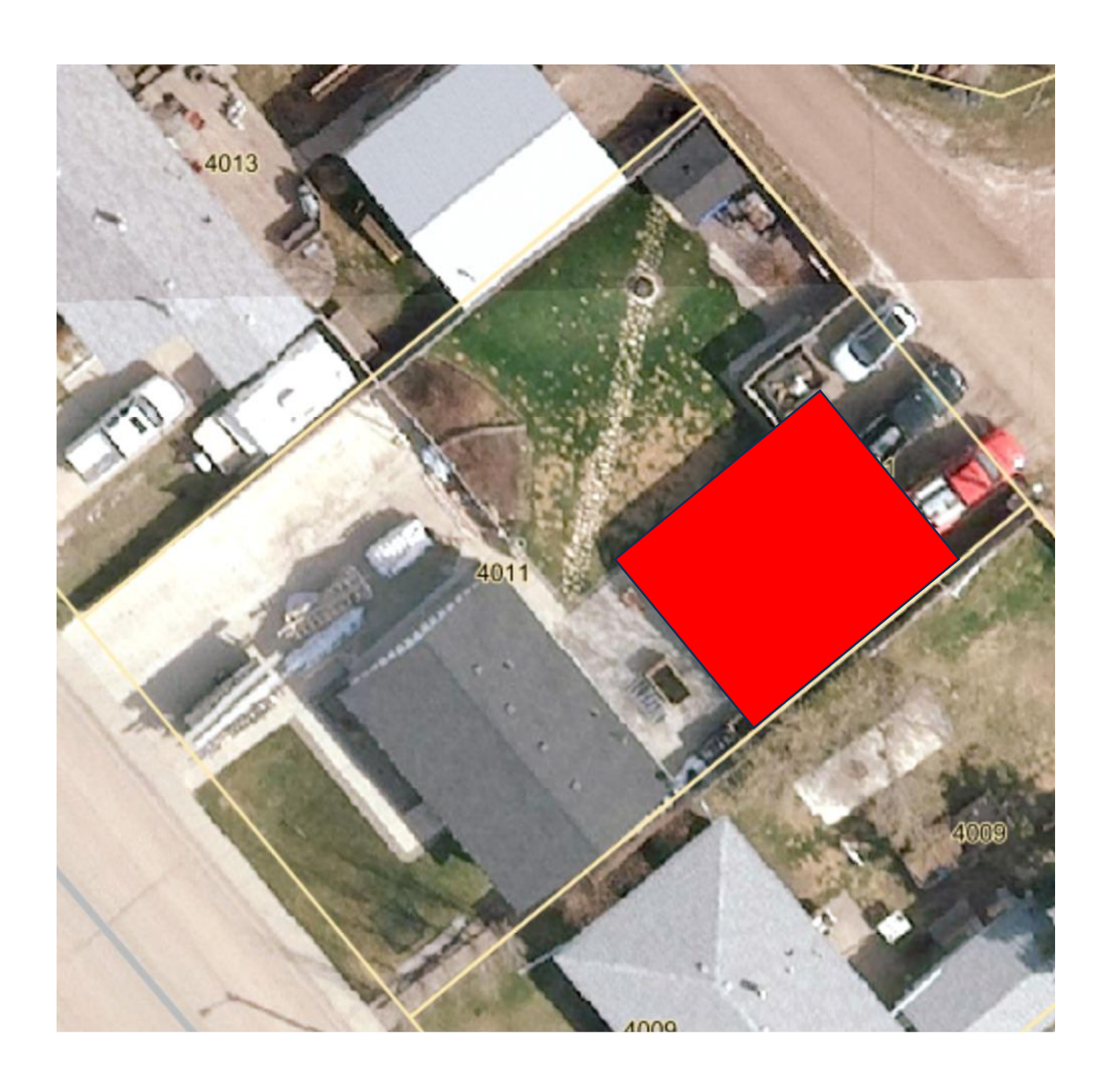
4011 – 57 Street New Proposed 28' by 38' Detached Garage